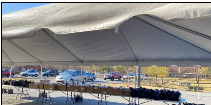
Boxes lined up and ready to serve community!

We were able to serve almost 1300 families representing over 4500 in the household for the month of March! Job well done!