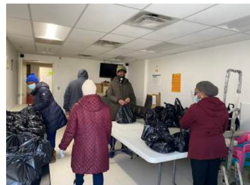
Workers make preparation!