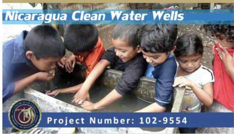
Nicaragua Clean Water Wells