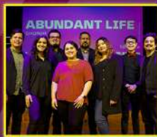
GRUPO VIDA ABUNDANTE MUSICAL GUEST