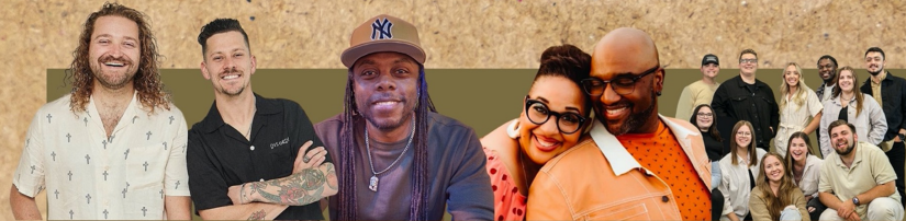
Sons the Band