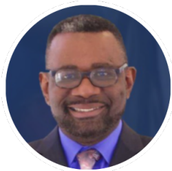
Bishop Stanley Murray Baltimore Central