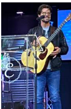
Jason Crabb Special Guest Singer